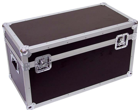
Cobra Flight Case FC82 Dimensions in mm, may vary slightly

Net Weight: 18kg Gross Weight: 19kg Robust metal catches on all openings Tough 7mm Laminated Plywood Construction Strong drop carrying handles Aluminium trim to protect edges Heavy duty metal corners